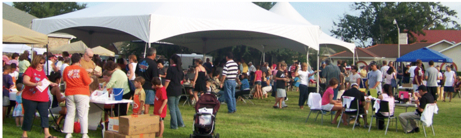
300 neighbors attended our Night Out Against Crime